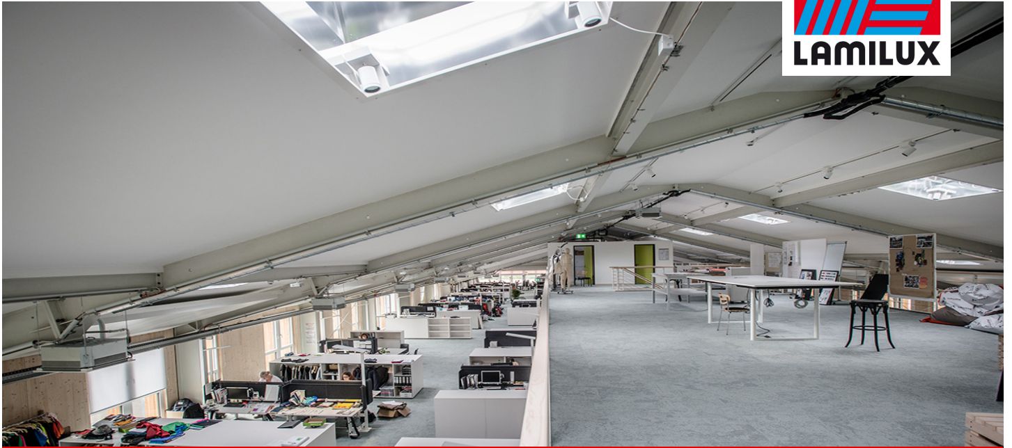
VauDe, Tett nang